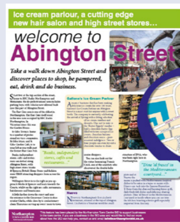
Chronicle & Echo feature: shining the spotlight on Abington Street and Eastgate